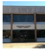
GLPLS Online Catalog